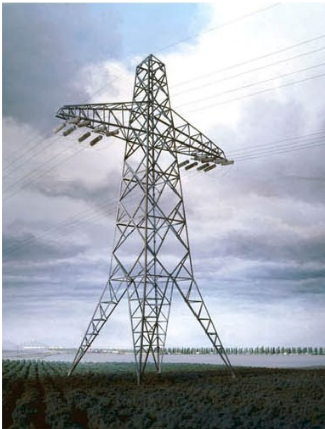
Edwin Zwakman, Pylon , 2007