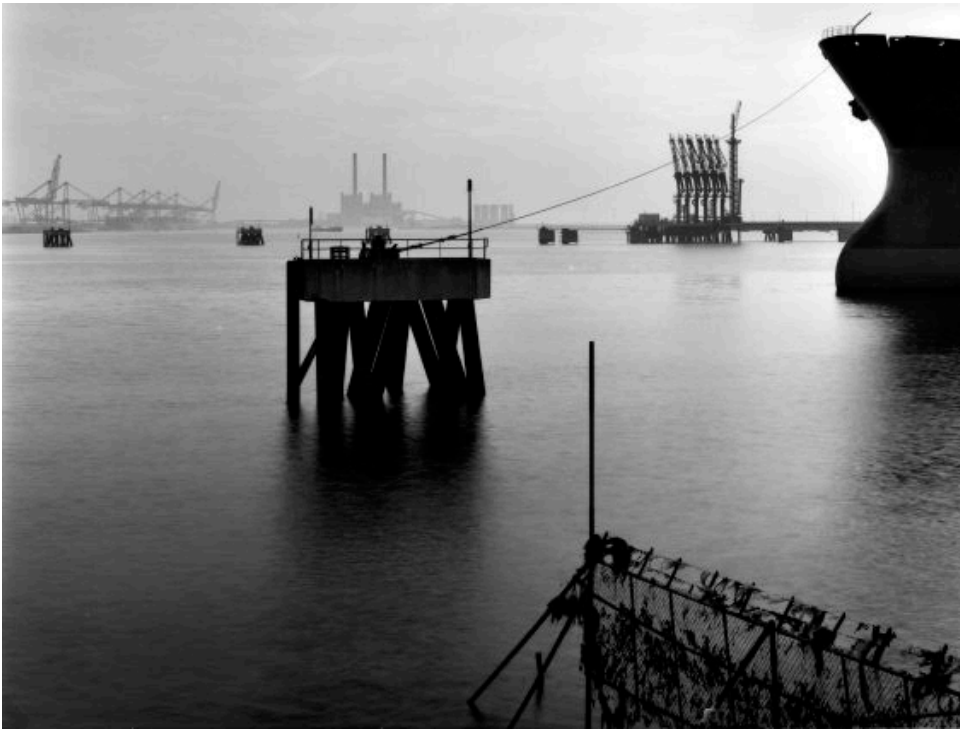
Jannes Linders, uit: Landschap in Nederland (Landscape in The Netherlands) , 1990 (commissioned by the Rijksmuseum, Amsterdam)